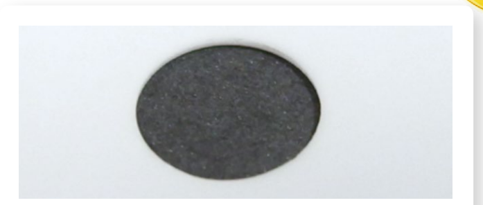
Figure 3: Digital camera photo of 5 mm diameter hole machined in 200 \mu m thick alumina ceramic plate shows very good edge quality and no discoloration of the material.

also come with challenges for precision machining, due to the hardness and somewhat brittleness of the material. Using the IceFyre's short picosecond pulses combined with a high speed, multi-pass trepanning process, 5 mm diameter holes were cut in the material with high quality and high throughput. Figure 3 shows a digital camera photo of the processed hole. The processing time was 0.8 seconds per hole, equating to a linear cutting speed of ~20 mm/s. The photo indicates that there is no darkening and debris deposition at the edges and sidewalls of the kerf that are often seen when processing with long pulse width lasers.