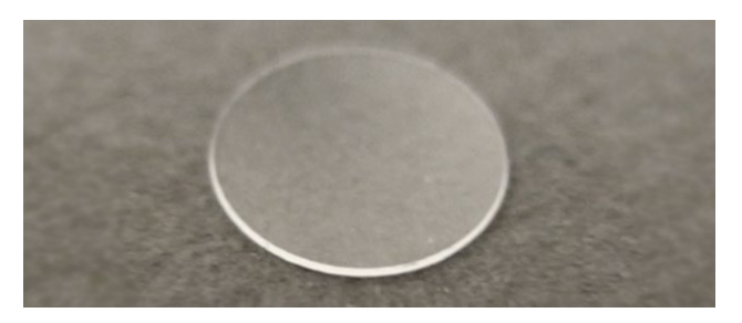
Figure 2: Macro camera photo of 5 mm disk cut from a 150 µm thick sapphire wafer

Due to its combination of high hardness, high electrical insulation, and high thermal conductivity, alumina ceramics are increasingly being used for applications such as light emitting diode (LED) heat sinks, high temperature printed circuit boards (PCBs), and device packages for harsh, high temperature environments. However, these advantages