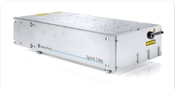
Figure 2. Spectra-Physics Spirit<sup>®</sup> One<sup>m</sup> high performance industrial femtosecond laser.