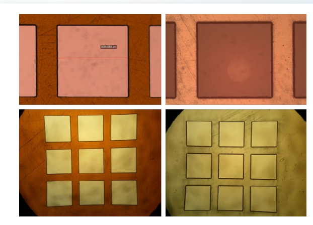
Figure 2. Microscope images of Polyimide (left) and Polyethylene Terephthalate (right) plastics cut using Spirit 1030-100-SHG laser from Spectra-Physics. Application of a femtosecond laser with average power of 100 W at 1030 nm results in cutting speed above 1 m/s for 75 \mu m thick plastics and very high quality (HAZ <50 \mu m).

versatility and performance, enabling a variety of applications. High average power (>100 W) and high pulse energy (>100 \mu J) at a wavelength of 1030 nm combined with high repetition rates (up to 10 MHz) and short pulse duration (<400 fs) pushes femtosecond micromachining applications to highest levels of throughput at lowest cost-of-ownership. The user-configurable burst mode enables processing with increased ablation efficiency, and thus increased throughput and quality for certain materials. Additionally, the integrated second harmonic generation (SHG) offers an output power of >50 W at a wavelength of 515 nm.