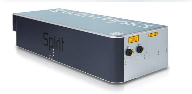
Figure 1. Spectra-Physics' Spirit 1030-100-SHG high power industrial femtosecond laser.

Femtosecond lasers are capable of machining plastic materials with minimum heat affected zone (HAZ) and very precise control of the material removal. Although the processing quality achieved meets industrial demands, processing speeds need to be improved to satisfy an industrial user. To process parts quickly and cost-effectively a femtosecond laser system with average power of >100 W is required. Additionally, the laser system has to be robust and stable to sustain the demands of the production floor. The Spirit® 1030-100-SHG laser from Spectra-Physics® (Figure 1) sets new standards for femtosecond lasers in high-precision industrial manufacturing. This laser offers impressive